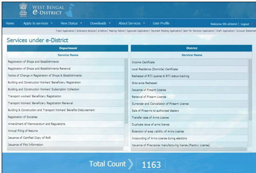
Figure 2: Home Page